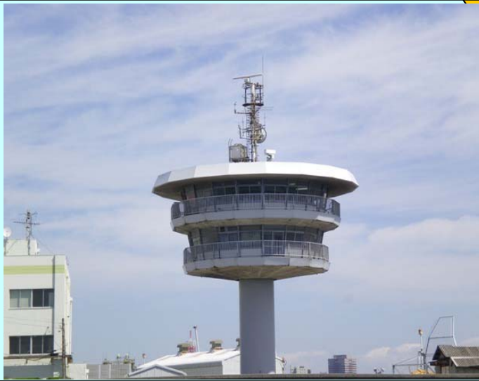
OLD TRAFFIC CONTROL SIGNAL STATION until March 13, 2012.

TRAFFIC CONTROL SIGNAL STATION IN CHIBA PASSAGE WILL BE MOVING FROM SHINMINATO TO CHUO WHARF.