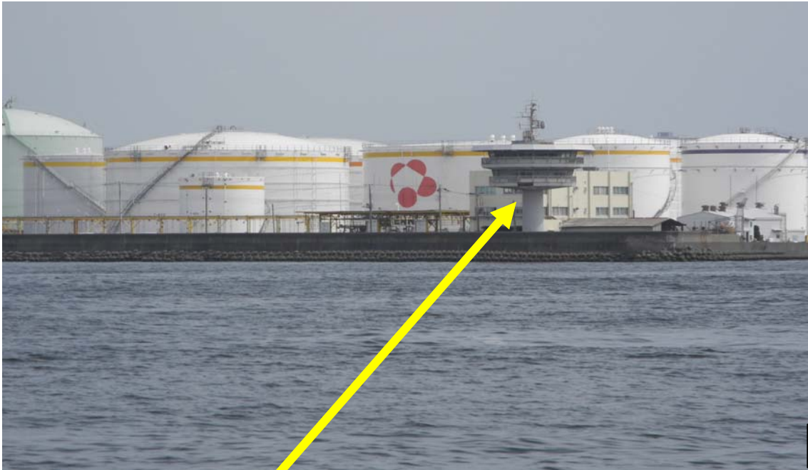
OLD TRAFFIC CONTROL SIGNAL STATION until March 13, 2012.