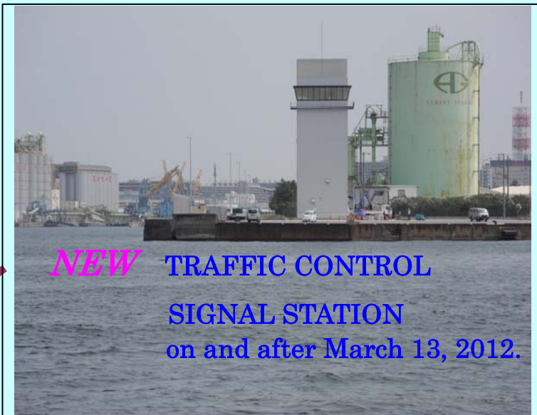
NEW TRAFFIC CONTROL SIGNAL STATION on and after March 13, 2012.